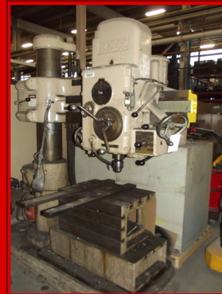
American "Hole Wizard" Radial Arm Drill