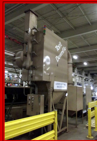
Torit V-Bottom Downflow Dust Collection System