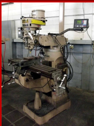
Supermax Model YC-1.5V/5-T Titan Series Vertical Milling Machine