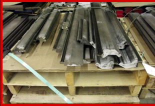
Large quantity press brake dies

INSPECTION DATE: April 12, 2013 8 AM to 3:30 PM