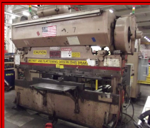
10' Dreis & Krump Model 810-L Mechanical Press Brake with CNC Back Gauge