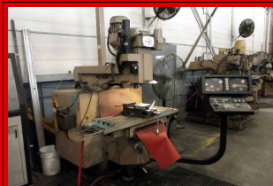
Hurco Model KM-3P CNC 3-Axis Vertical Milling Machine